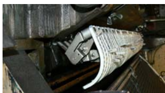
All models of Hanscho*

250,000+ QuickSet levers installed Worldwide