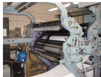
All Goss Community* Units: New or Old