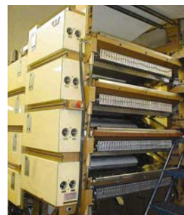
All Quad-Stacks, Quadra-Color, and Web Leader units*