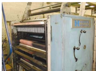
All models of Harris* Presses—new or old—even to replace old Telecolor* systems